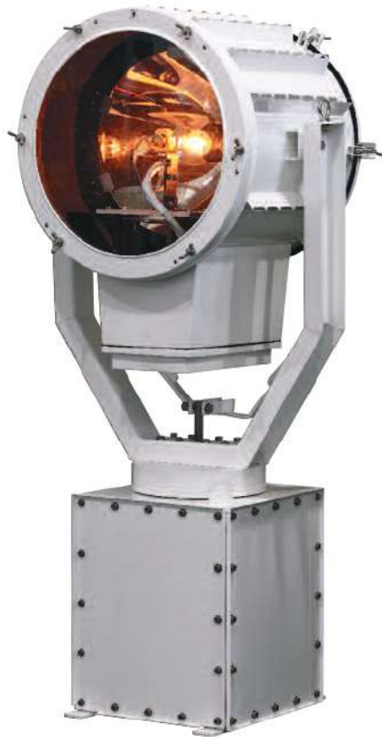
XENON SEARCH LIGHT • 360W~10,000W