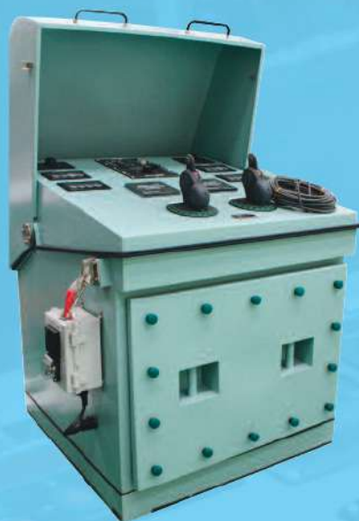
BRIDGE WING CONSOLE