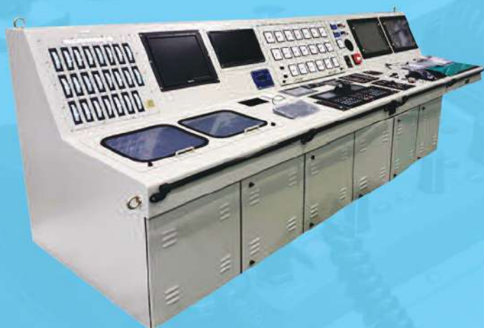
ENGINE CONTROL CONSOLE