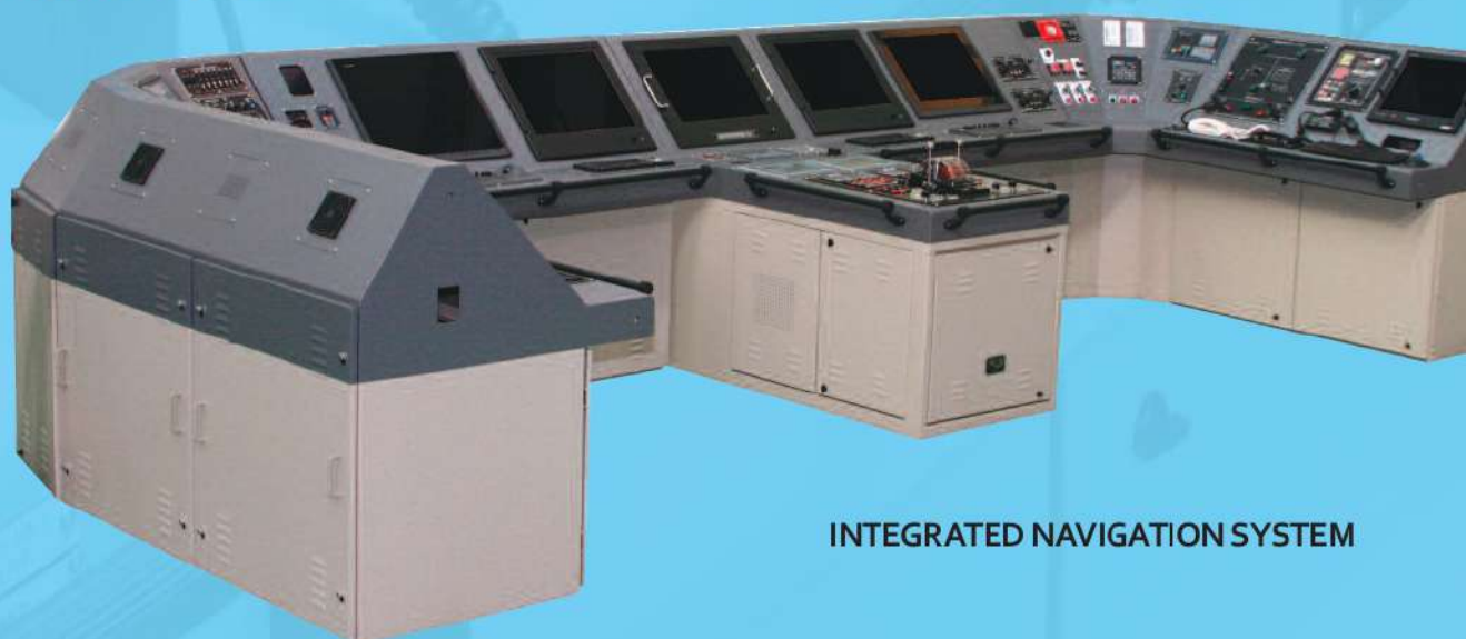
INTEGRATED NAVIGATION SYSTEM