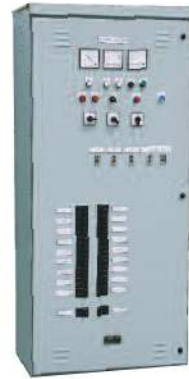
BATTERY CHARGE & DISCHARGE BOARD

To maximize customer's satisfaction, we will try to provide faithful services and superior products based not only upon advanced technological capabilities and reliable quality but also upon sincere and trustful relationships with customers.