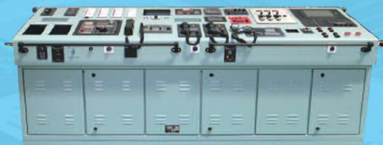
BRIDGE CONTROL CONSOLE