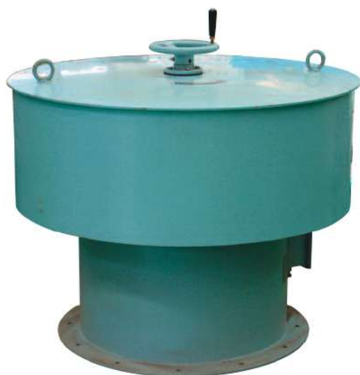
AXIAL FLOW FAN • 0.4KW~25KW