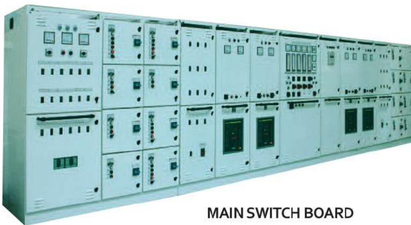
MAIN SWITCH BOARD