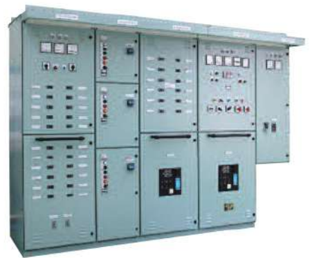
EMERGENCY SWITCH BOARD