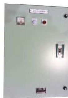
XENON SEARCH LIGHT POWER SUPPLY