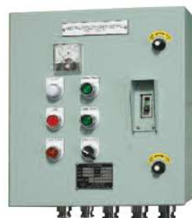
CAPSTAN STARTER PANEL