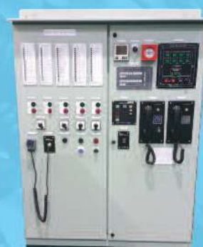
ENGINE CONTROL CONSOLE